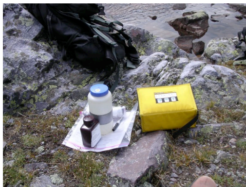
Miles Newby, Forest Service employee, samples Lake Snowdon water on demonstration tour for Four Corners Air Quality Task Force members September 14. The lake, at 12,000', is in Weminuche Wilderness.