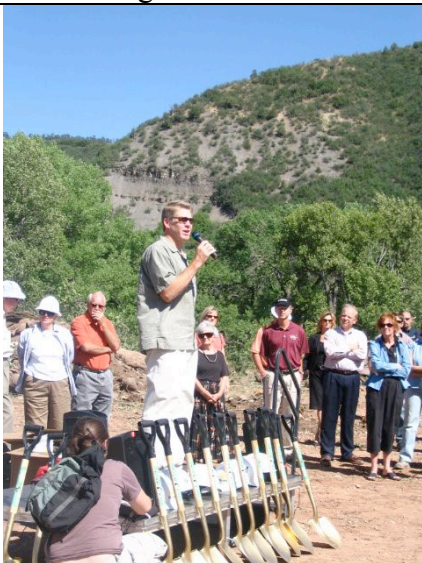
Mayor Doug Lyon presiding over ground-breaking for our new library June 16, 2007!